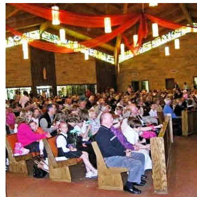
Worship is at the heart of our parish life.

This is our grace-filled moment. Empowered by prayer and committed to shared sacrifice, we can achieve our campaign goals. Having faith in our future, we trust that Jesus is building the parish of St. Dominic into a community that seeks Christ, knows Christ and becomes Christ, each one for the sake of all.