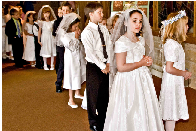
Our parish continues its long tradition of passing the faith on to future generations.

Our parish is rich in tradition and was built by families committed to living an active faith life. We are here today because these pioneer families believed in the value of community, Catholic education and faith formation for every parish member. Most importantly, they sought a community where passing on the faith to future generations was a priority. Our early families sacrificed to build the church we inherited. They were faithful stewards for those of us who have followed in their footsteps.